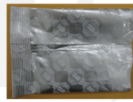
Alum. Back fin bag 鋁箔合掌袋 適用: WVM series