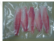
Nylon Channelled (Lined) bag 尼龍條紋袋 適用: WVM series