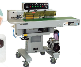
Nozzle Type 吸嘴式