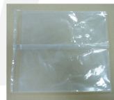
Nylon back fin bag 尼龍合掌袋 適用: WVM series