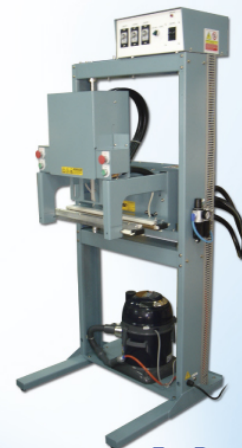
For Powder 粉末外抽真空封口機