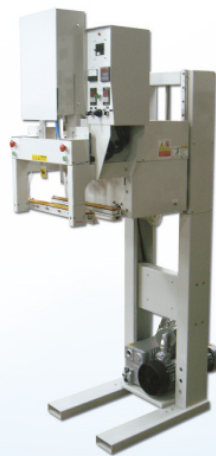
Constant heat with vacuum 直熱式外抽真空封口機