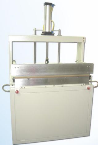
For Quilt, Blanket, Down Jacket 棉被、毯子、羽絨衣、羽絨被

以上機種： ● 充氮設備不含氣瓶 ● 客戶需自備空壓機 5-7 kgs/cm 2 ● 請來樣試包 ● 除專業製造抽氣，封口包裝機械，亦可依客戶需求提供設計與製造之服務 歡迎洽詢